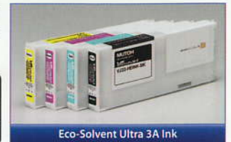
Eco-Solvent Ultra 3A Ink