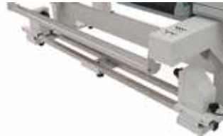
> 80 kg motorised take-up system