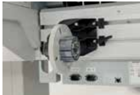
> repositionable scroller support

Depending on your volume and application needs, different optional motorised take-up systems for roll weights up to 30 kg are available. We also offer fully motorised roll-off/take-up systems for rolls up to 80 and 100 kg.