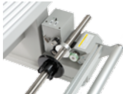
> 30 kg motorised take-up system