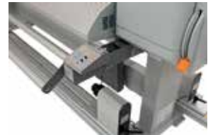
> 100 kg motorised take-up system